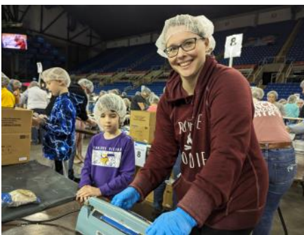
Thank you to all who volunteered on January 6th at the Feed My Starving Children Packing Event.

The seven youth that signed up for the National Youth Gathering in July 2024 have been working hard to raise money for their trip. They appreciate everyone's support in their fundraisers and look forward to seeing everyone at Ham Bingo on March 15 th at the Wahpeton Community Center, Doors open at 6 pm and BINGO starts at 6:30. There will be a mix of 50/50 prizes and hams for Easter!