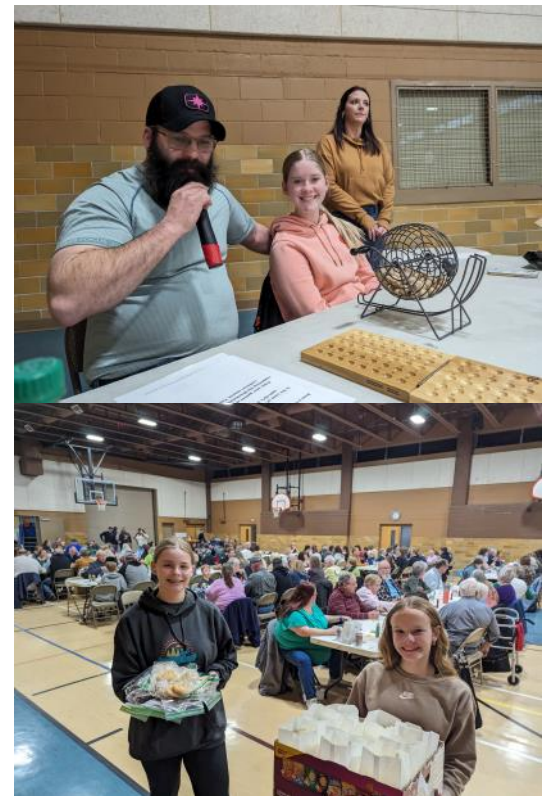
The Youth attending the National Youth Gathering held Ham Bingo on March 15th. Thank you to all who attended and helped out with this event.