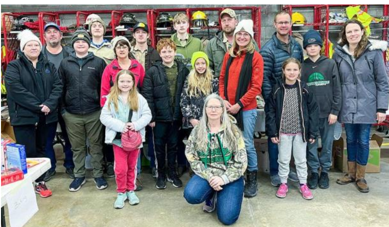
Breckenridge Lutheran Church teamed up with Boy Scout Troop 332 for a scouting for food service project on Saturday, March 16. The day saw 18 volunteers go door to door asking for food donations. The group collected 1,371 pounds of food. Proceeds were donated to the Richland-Wilkin Food Pantry.

WE ARE LOOKING FOR A PING PONG TABLE. IF YOU HAVE ONE TO DONATE, PLEASE CONTACT THE OFFICE.