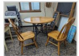
Table & 2 Chairs $50/obo

Oval Coffee Table-19x46 2 End Tables-26x25 Adjustable Height Legs $100/obo